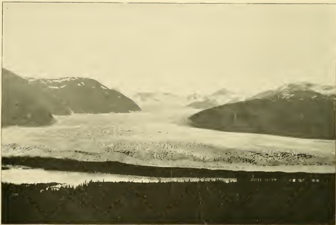
The Stickeen Glacier, or Ice Mountain.